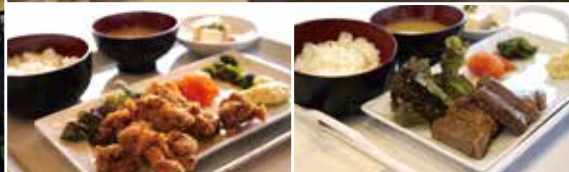
A wide range of set menus and snacks are available.