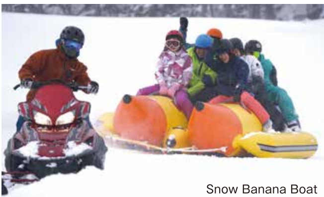
Snow Banana Boat

Dedicated course, two football courts in size, with exciting up-and-down slopes! Capacity: 4 people. Kids under 10 years of age ride with a parent/guardian.