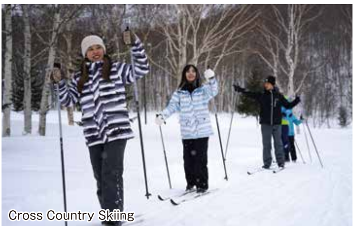
Cross Country Skiing

snowmobile tows a banana boat through a special snow course! Hold on tight and feel the speed! Capacity: 4 people. Age limit 6 years and over