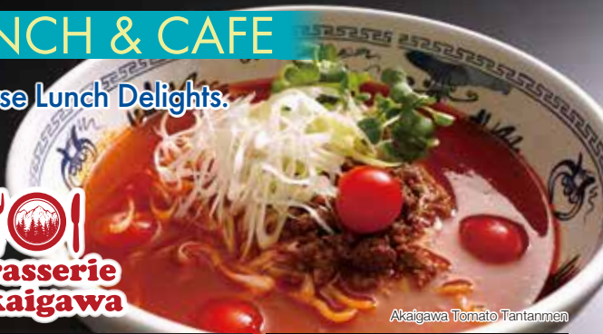
Akaigawa Tomato Tantanmen