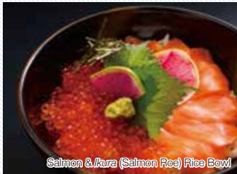
Salmon & Kura (Salmon Roe) Rice Bowl