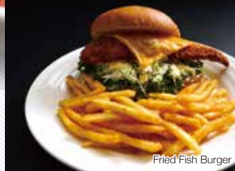
Fried Fish Burger