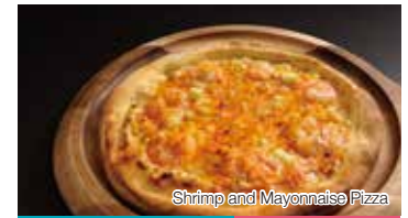
Shrimp and Mayonnaise Pizza