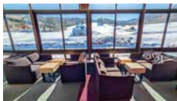
Mountain Center 1F