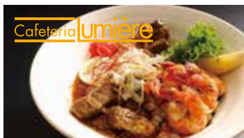
Mountain Center 1F