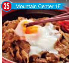
35 Mountain Center 1F