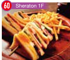
60 Sheraton 1F