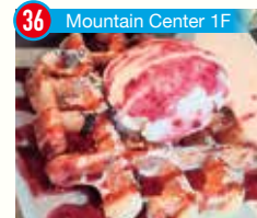
36 Mountain Center 1F