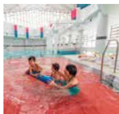
Kids zone (depth 55cm and 85cm) with rest space available.