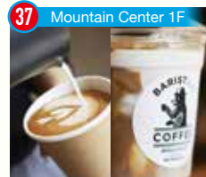
37 Mountain Center 1F