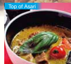
Top of Asari