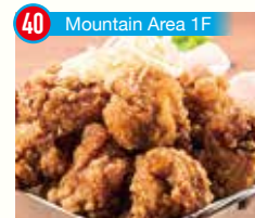
40 Mountain Area 1F