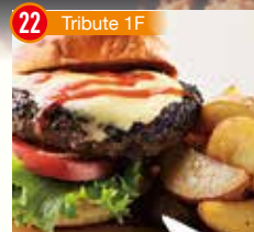
22 Tribute 1F