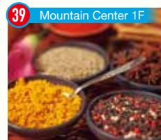
39 Mountain Center 1F