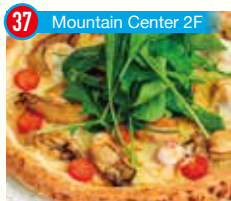
37 Mountain Center 2F