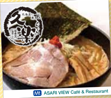
Mt ASARI VIEW Café & Restaurant