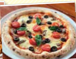
Mt HOPPI HILLS Farm Country Pizza