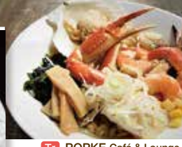
Tr POPKE Café & Lounge