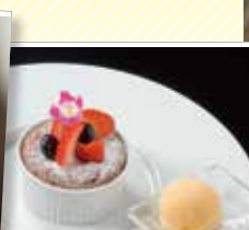
Sh LOBBY LOUNGE