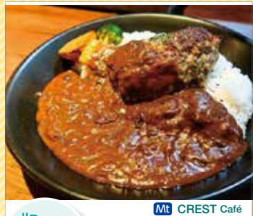
Mt CREST Café