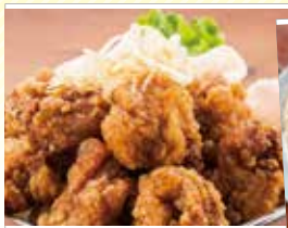
Mt SHIRO Foods Stand

Delicious steaks and local seafood in luxury space. ★