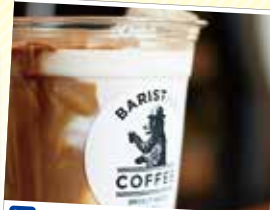
Mt BARISTART COFFEE KIRORO