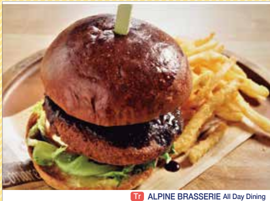
Tr ALPINE BRASSERIE All Day Dining