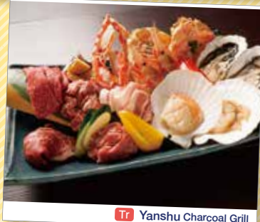
Tr Yanshu Charcoal Grill