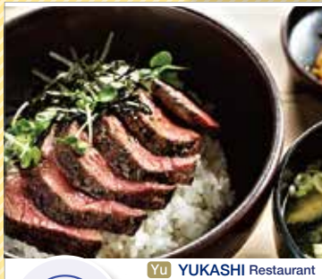
Yu YUKASHI Restaurant