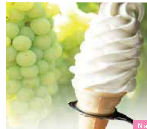
Niagara grape softcream