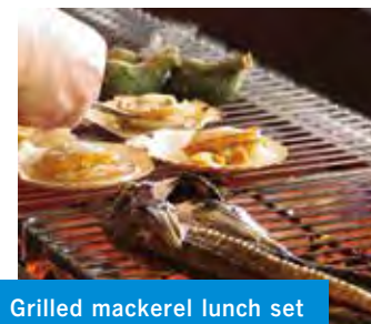
Grilled mackerel lunch set