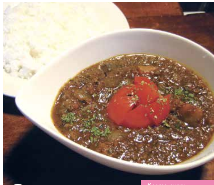
Keema curry (available weekday lunch time)