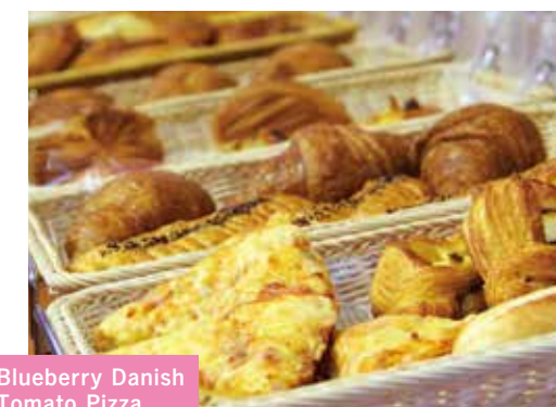
Blueberry Danish Tomato Pizza