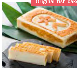
Original fish cake