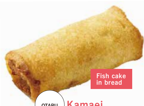
Fish cake in bread