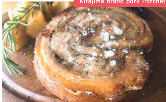
Kitajima brand pork Porchetta