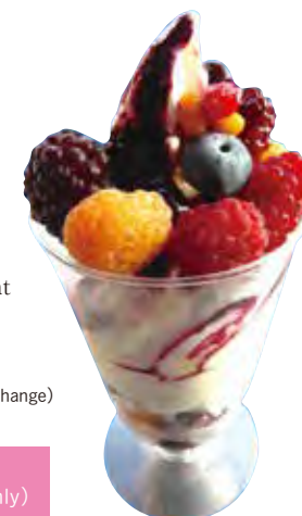
Very berry parfait (Sold during the summer only)