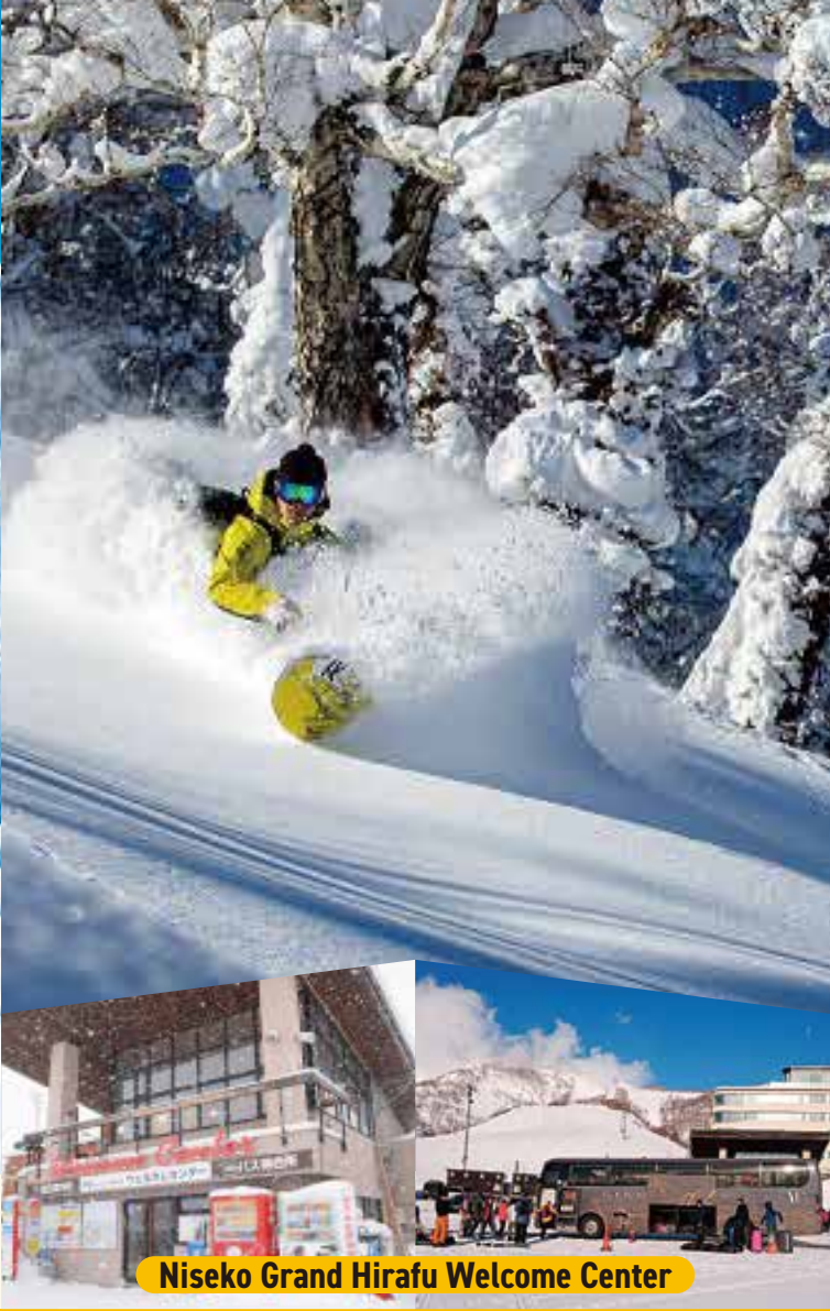
Niseko Grand Hiraifu Welcome Center